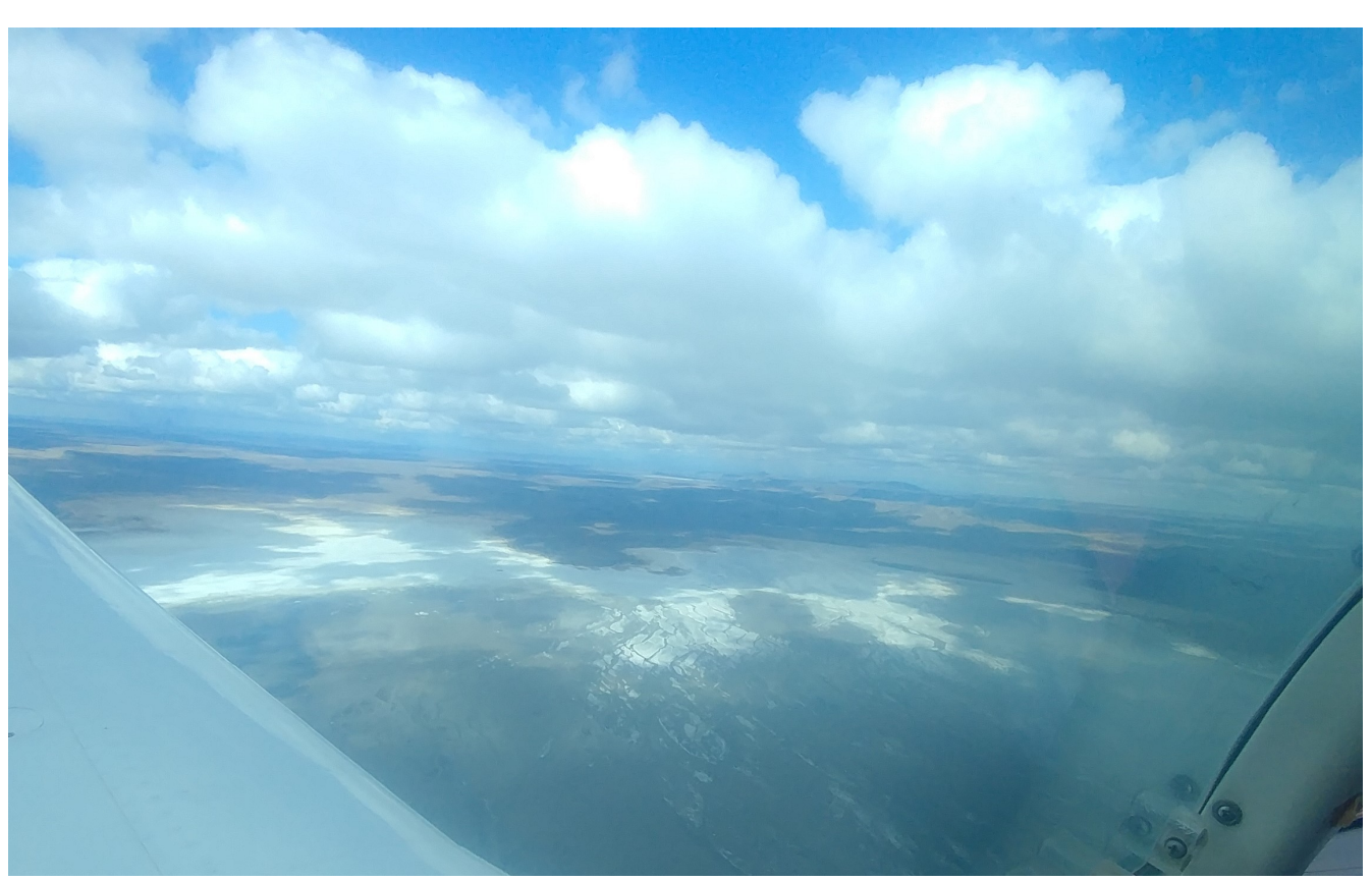
Lake Abert showing spring colors.